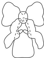
Fig. 1 angel

Cut out patterns from fused fabrics. (Note: Use photo and Figures 1-4 as placement guides. Overlapping pieces are shown by dotted lines on figures.)